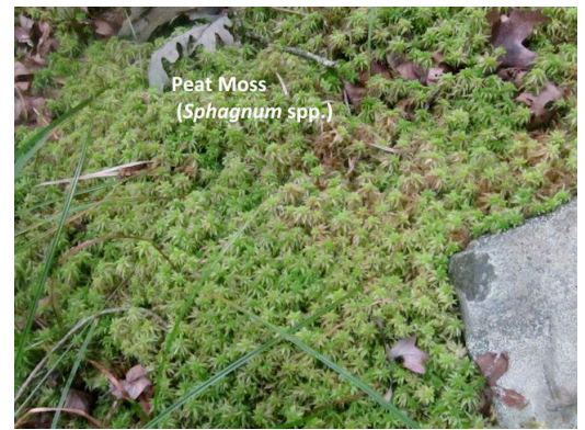
Peat Moss ( Sphagnum spp.)

Walking around the pond, I found a patch of Peat Moss ( Sphagnum spp.), so the pond outflow has created a small bog.