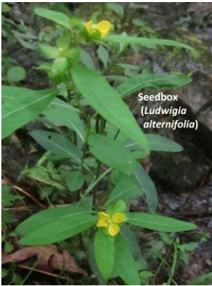
Seedbox ( Ludwigia alternifolia )

Next to the orchid was another wet-loving plant, Seedbox ( Ludwigia alternifolia ), with yellow flowers typical of the Evening Primrose (Onagraceae) family. The flowers will turn into the cubic pods that give the plant its common name.