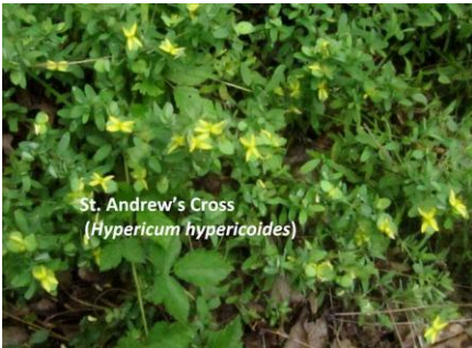
St. Andrew's Cross ( Hypericum hypericoides )

Beyond the pond I discovered some large St. Andrew's Cross ( Hypericum hypericoides ). I often see them in drier places, but much smaller, so they must enjoy the moisture too. They get their name from the shape of the flower.