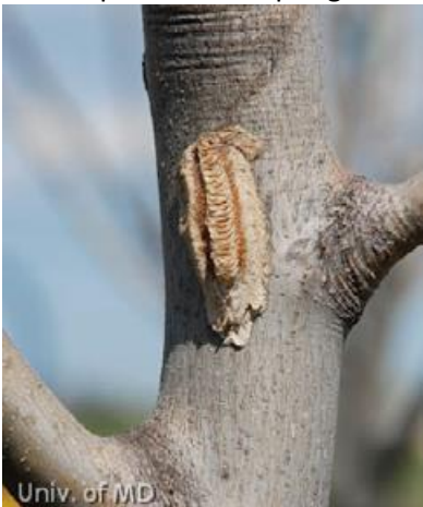
Carolina Mantis egg mass

As you start your spring cleanup, be on the lookout for your beneficial insect egg casings. One of the common (and largest) ones you will see are mantis egg casings. Do you know which variety is the smaller? The native Carolina Mantis ( Stagmomantis Carolina ) egg mass is packed in rows and is smaller than the introduced Praying Mantis ( Mantis religiosa ) and Chinese Mantis ( Tenodera aridifolia ). All eat bugs, good and bad ones. Try to keep these in your landscape until late spring. The mantis nymphs will hatch in early to mid-May.