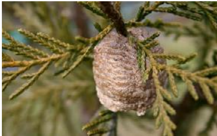
Chinese/Praying Mantis egg mass