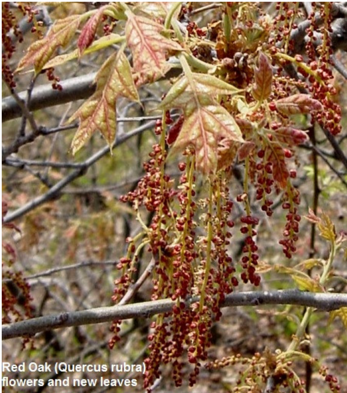
Red Oak ( Quercus rubra ) flowers and new leaves

I plan to tell you about some big trees in our area. Virginia Tech keeps the list of Virginia big trees at ( http://bigtree.cnre.vt.edu/ ) and American Forests keeps a list of national champions at http://www.americanforests.org/explore-forests/americas-biggest-trees/champion-trees-national-register/ . The Remarkable Trees of Virginia by Nancy Hugo and Jeff Kirwan is a book with descriptions and beautiful pictures of many special trees.