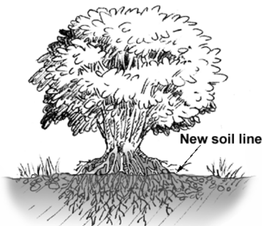
Frost heaving is most common in small, new plantings. The danger is root exposure. Replant quickly.

Although it is unattractive, small evergreens can be protected by using windbreaks made out of burlap, canvas, or similar materials. Windbreaks will help reduce the force of the wind and shade the plants. They can be created by attaching materials to a frame around a plant. A complete wrapping of straw or burlap is sometimes used. Black plastic should be avoided as a material for wrapping plants. During the day heat builds up inside, increasing the extreme fluctuation between day and night temperatures and speeding up growth of buds in the spring, making them more susceptible to a late frost. If plants require annual protection measures to this extent, move them to a more protected location or replace them with hardier specimens.